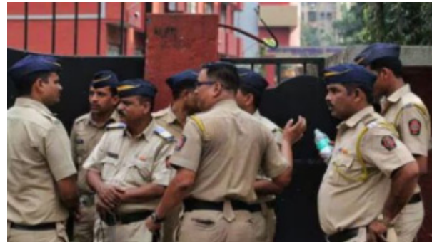
June 11

The Hyderabad police Wednesday announced the arrest of a 19-year-old man from Rajasthan for allegedly impersonating senior Indian Administrative Service (IAS) and Indian Police Service (IPS) officers online and fraudulently obtaining money from their contacts. They said he was involved in two similar cyber fraud cases in Telangana.