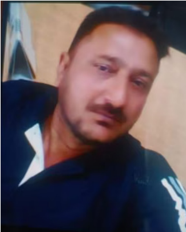
GNS News Agency, June 11