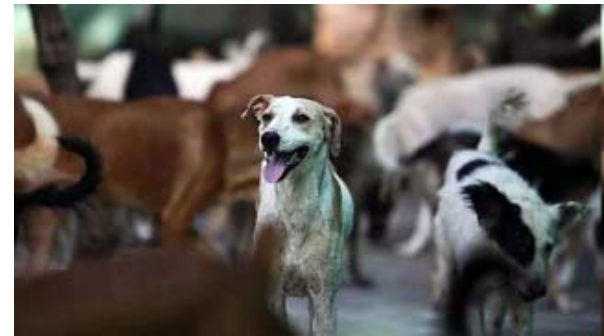
GNS News Agency,April 5 stray dogsThe directive said that students should also be warned against throwing stones, pebbles, and sticks at dogs, as well as hitting, yelling at or running from a dog.In a first, the Paschim Banga Samagra Shiksha Mission (PBSSM) has issued a directive to all District Education Officers for the implementation of safety measures for preventing stray dog attacks on children in West Bengal.According to the directive, state schools have been advised to utilise the morning assemblies to educate and sensitise the children. Some of the suggestive measures are to not to go near stray dogs or groups of dogs. The directive said that students should also be warned against throwing stones, pebbles, and sticks at dogs, as well as hitting, yelling at or running from a dog.

Teachers have also been instructed to be careful during midday meals to prevent the entry of dogs into school premises and to take extra precautions during the canine breeding season when dogs tend to be more aggressive.The directive was issued following a letter from the department of School Education & Literacy, Ministry of Education (MoE) of the Union government. The letter states that the NCPCR (National Commission for Protection of Child Rights) has made recommendations to ensure the safety and self-protection of children, emphasising the role of municipal bodies under the Animal Birth Control (ABC) Rules, 2023.Speaking to The Indian Express, Animesh Halder, South 24