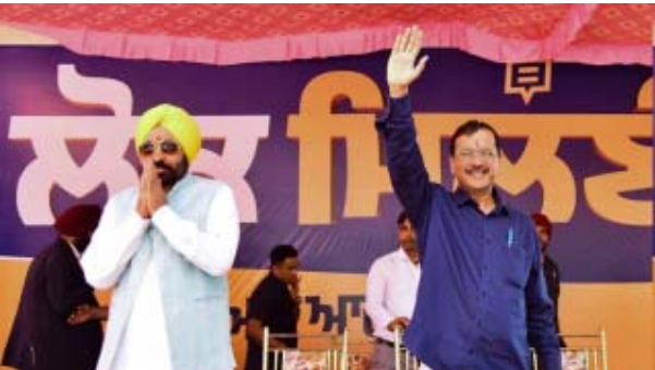
April 5 Wary of a repeat of last year's paddy procurement fiasco, the Punjab government is not taking any chances in the current wheat procurement season that began on April 1, even as a shortage of storage space remains a pressing concern.Sources told The Indian Express that Aam Aadmi Party (AAP) national convener Arvind Kejriwal recently called a meeting of state government officials on procurement and told them that he would not like a repeat of the situation. Last year, paddy procurement was delayed due to a shortage of storage space, leading to a glut in the mandis.It was after Kejriwal's meeting that Punjab Chief Minister Bhagwant Mann met Union Minister of Consumer Affairs, Food and Public Distribution Pralhad Joshi on March 26, seeking to expedite the movement of foodgrains from the state. “The CM sought that at least 40 rakes of foodgrains should be moved out of Punjab to recipient states every day. This way, we will be able to clear space by June 30 this year. The Union minister assured us that this would be done,” said an official.Mann told Joshi that the state is expected to procure 124 lakh metric tonnes (LMT) of wheat. Around 5 lakh tonnes of wheat from the previous season is also stocked in the state due to which the government has to make arrangements for the storage of about 129 lakh tonnes of wheat. Mann said that due to the space crunch, most of the covered space available with the agencies is being diverted for the storage of rice.Mann said that as per the availability of storage space, the state would require at least 25 LMT of wheat to be moved via direct delivery special trains to cope with the shortfall in storage space. He also informed the Union minister that due to the shortage of space for rice, only 45 per cent of rice due has so far been accepted by the Food Corporation of India (FCI). He said that on March 26, the space available with FCI was for 7.50 LMTs, while a total of 71.50 LMTs of rice is yet to be delivered.Punjab can store 175 lakh tonnes of grains under covered spaces and 60 lakh tonnes in open plinths. Of this 235 lakh ton capacity, space for at least 100 lakh tonnes would be needed between April 15 to May 15.