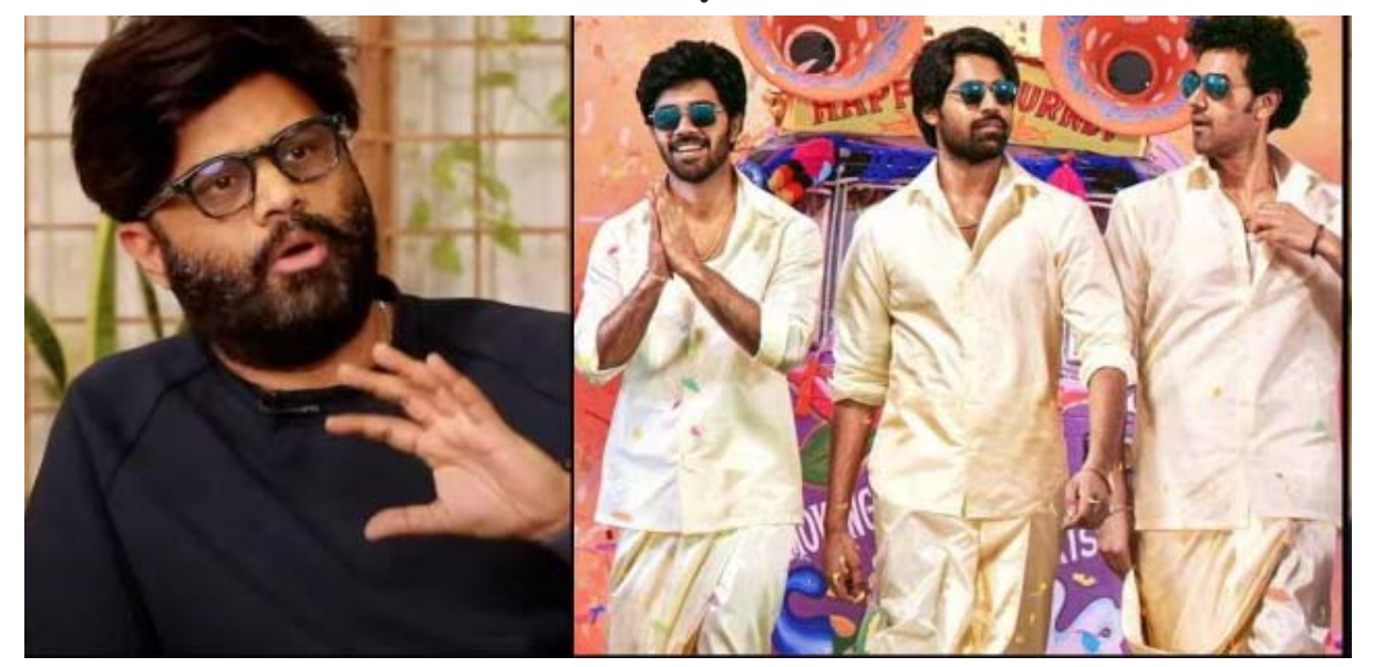
In recent times, producer Naga Vamsi is undoubtedly sections of the media actually disliked him or his films, ther

Naga Vamsi lashes out at critics of Mad Square: 'If you hate me that much, ban my films, don't take ads...'