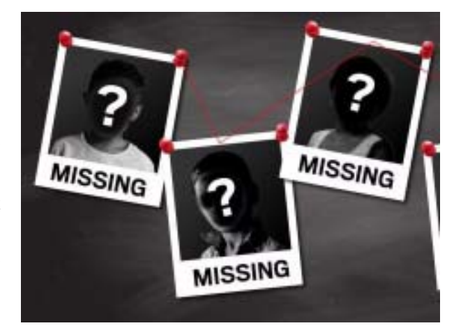
home to Burari. The teenager was found nearly a month later, on July 15, at North West Delhi's Bawana."For days,

of India indicates that the country will need 1.5 million cybersecurity professionals by 2025.