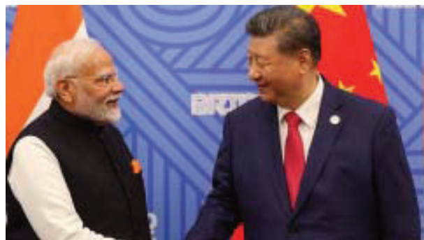
GNS News Agency, April 1

China and India should work more closely together, Chinese President Xi Jinping told Indian President Droupadi Murmu, describing their relationship as a "Dragon-Elephant tango," a dance between their emblematic animals. Mr. Xi said the neighbours should find ways to