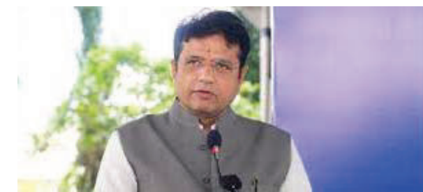
Hyderabad, April 1 (NSS): Minister for Industries