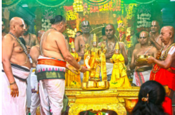
"April 12, Indian Chronicle, Rayalaseema coordinator "The annual three-day Vasanthotsavam-spring festival concluded on a grand celestial note at Vasanta Mandapam in Tirumala on Saturday evening. "The cele-