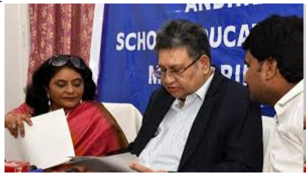
69% of students passed, which is the highest in ten years. In the Intermediate first-year examinations, 47% of students passed, the second-highest percentage in the decade

The results achieved by students in the Intermediate examinations are a testament to this change. This year, the pass percentage of Intermediate students has increased to a record level - a feat not seen in the last ten years. This remarkable improvement is a direct result of the quality-enhancing measures taken by Minister Nara Lokesh. Government junior colleges have seen an exceptional rise in student pass percentages - the highest in the last decade. In the Intermediate second year, a record-breaking