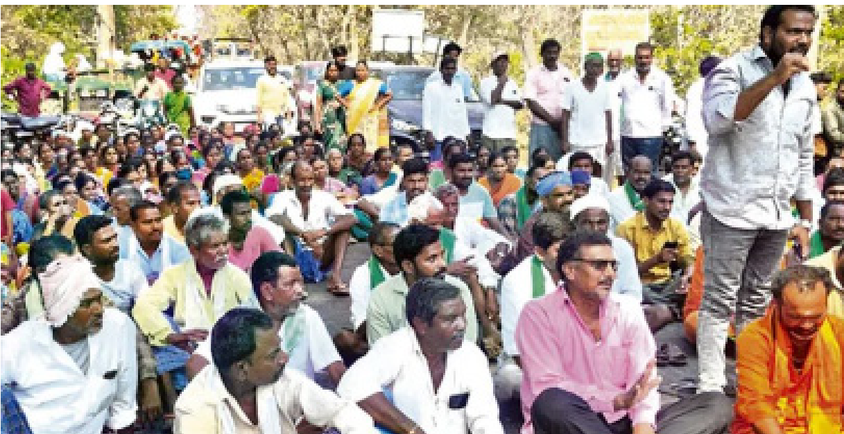
GNS News Agency, April 9

Nirmal: Farmers from different villages demanded the government to take steps to ensure irrigation facilities to their crops cultivated under Sadarmat irrigation project in this ongoing Yasangi season. They staged a rasta-roko in Kaddampeddur mandal centre on Wednesday.Around 300 farmers belonging to Lingapur, Mallannapet, Elagadapa, Dildarnagar, Masaipet, Nachanellapur, Pettarpur, Maddipadaga, Laxmisagar, Sarangapur and many other villages blocked the traffic demanding the government to provide water to their crops. They recalled that they raised crops by pledging gold after being assured by local public representatives and officials of ensuring the irrigation facility to their crops at a meeting held on January 2.