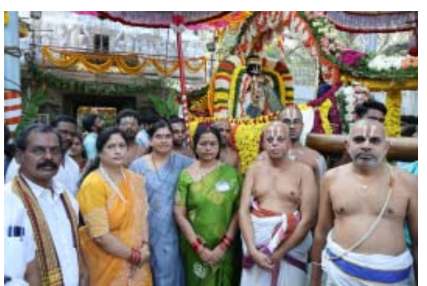
March 31, (Indian Chronicle), tirupati district correspondent "The ongoing annual Brahmotsavam at Sri Kodandarama Swamy temple in Tirupati witnessed Sri Rama blessing His devotees as Mohini. On Monday morning, the deity draped in colourful robes and flowers and daz-