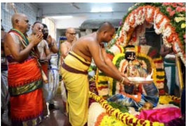
zling jewels seated majestically inside the finely decked Palanquin as Universal Celestial Damsel which mesmerized the devotees. The pontiffs of Tirumala, DyEO Nagaratna and others were present.