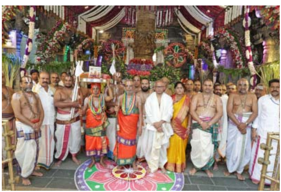
"March 30, (Indian Chronicle), Tirupati district correspondent, "Sri ViswavasU Ugadi Asthanam was held with utmost religious fervour in Tirumala temple on Sunday. "After awakening Swamy varu with Suprabhatam at 3 am Shuddhi was performed. At 6 am, a special offering is made to Sridevi Bhudevi