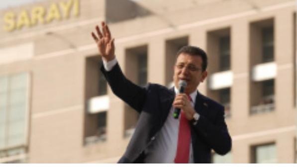
March 21

Turkish police on Wednesday (March 18, 2025) arrested Istanbul's Mayor — a key rival of President Recep Tayyip Erdogan — as part of an investigation into alleged corruption and terror links, media reported. The state-run Anadolu Agency said prosecutors issued warrants for some 100 other people. Authorities closed several roads around Istanbul and banned demonstrations in the city for four days in an apparent effort to prevent protests following the arrest.